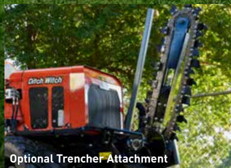
Optional Trencher Attachment

Featuring three front-end configurations (Hydra-bore, Trencher, and Reel carrier), the PT37 brings added productivity without the need for additional equipment or labor.